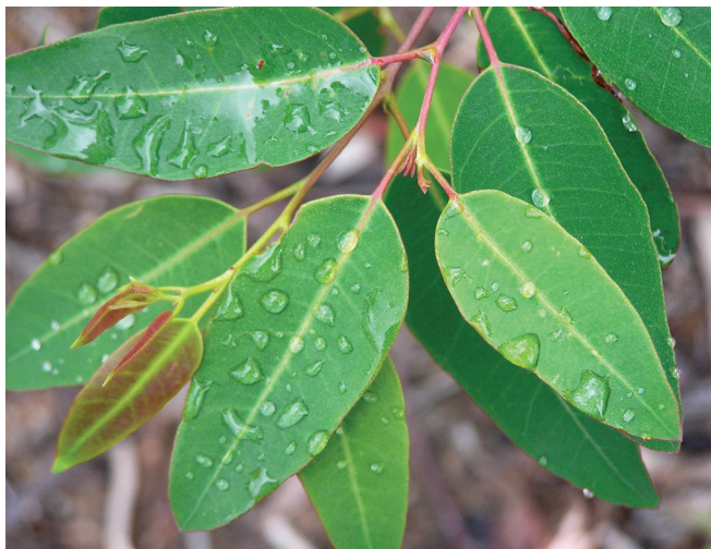
Native Plant Eucalyptus

The tree inspection fee is refundable if suitable new replacement trees are purchased and receipts are provided to Council in accordance with the Sustainability Tree Replacement Incentive Program (STRIP). A brochure explaining the STRIP scheme is provided with every tree removal permit that is issued by Council.